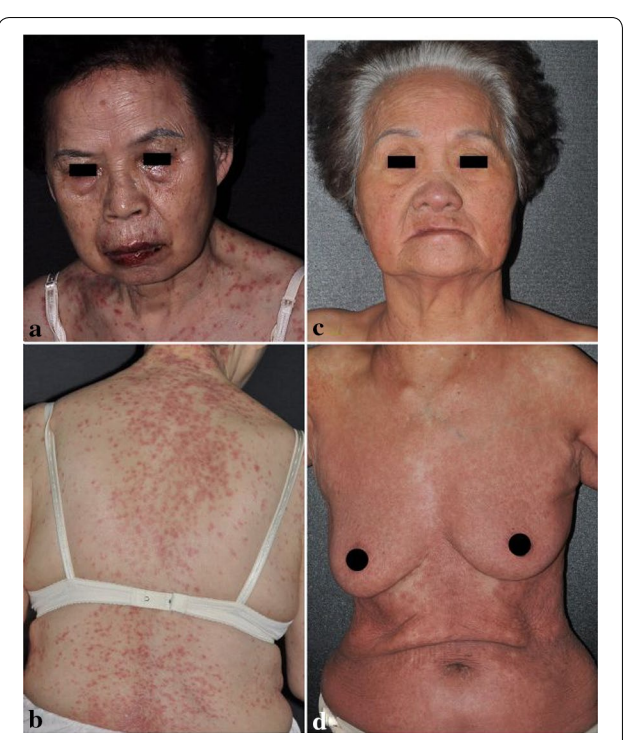
Fig. 3 Clinical presentations of strontium ranelate-induced severe cutaneour adverse drug reactions. A case of Stevens–Johnson syndrome (SJS) had necrotic erosive lesions on the lips and scattered dusky red macules over the face and neck ( a ), and close up view of the nape and back with dusky macules/patches and some necrotic epidermal detachment ( b ). Another case of drug reaction with eosinophilia and systems symptom presented with facial edema ( c ), and extensive confluent infiltrative erythematous eruption disseminated to the truck ( d )

allergic to either strontium ranelate or bisphosphonates as alternative drug.