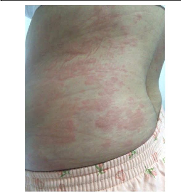
Fig. 1 Urticarial lesions on trunk

Background: Bupropion is a new-generation antidepressant, while its sustained release (SR) formulation is used in smoking cessation for a long time successfully. Urticaria, pruritus and rashes can be seen in 1-4 % of the patients and anaphylactoid reactions like angioedema and dyspnea can be seen in 0.1-0.3 % of the patients using bupropion. We wanted to report a case with urticaria and angioedema due to SR bupropion treatment.